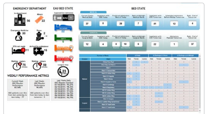
An example dashboard showing key metrics for A&E and Bed State.

Some of the clinical reporting has changed the way Gateshead NHS analyse and act on their data. For example, Yellowfin can help them identify a patient who is ready to be discharged so they can aim their clinical resources at getting them discharged for example: triggering a social care assessment, a physio assessment or fulfilling a prescription prior to departure. The data route ‘Estimated Date of Discharge (EDD)’ helps them to monitor nurses and consultants’ diagnoses, and review and compare wards for accuracy.